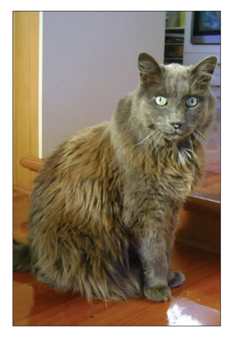
Monster - a whopping 9kg, is a good example of how medicating for HCM can improve quality of life!

Monster provides a good example of where medication for HCM appears to make a substantial and prolonged improvement in quality of life.